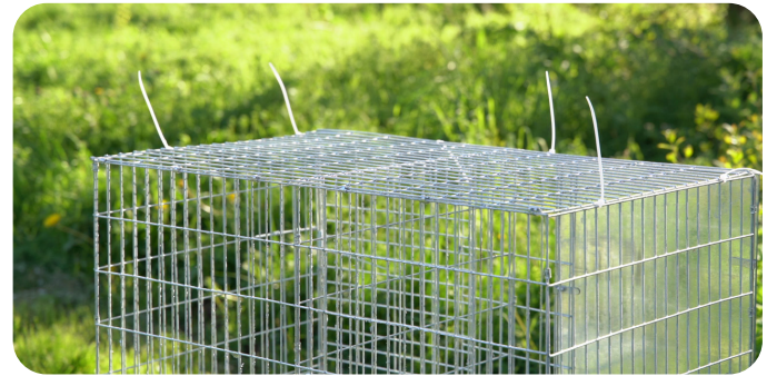
4) Turn the trap upside down and secure the second fence with zip ties in the same way.