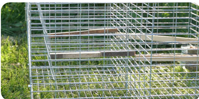
7) Press down on the spring-loaded fence to open it and opposition two wooden planks so they prop open the fence.