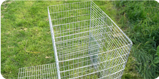
1) Unfold the Larsen trap and stand up right.

The Racan Larsen trap is perfect for capturing magpies and other species of corvid. This trap should only be used in compliance with the .gov general licencing (GL40, GL41, GL42) If unsure about any legal aspect of using or trapping wild birds, then please contact DEFRA directly or refer to https://www.gov.uk/government/collections/bird-licences .