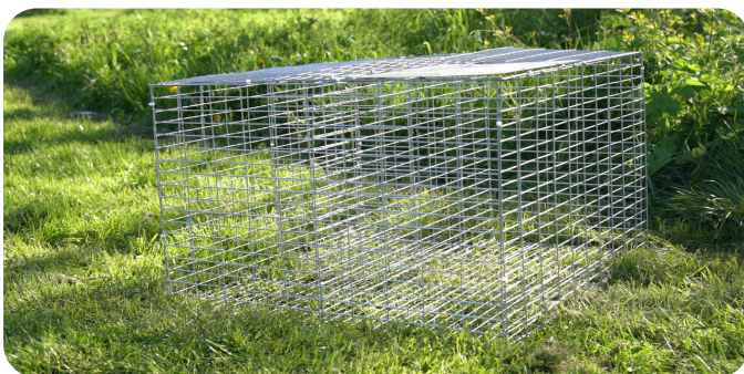
5) Lay the trap down flat with the metal plated side facing upwards.