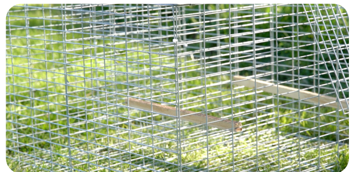
6) Open the fence next to the metal plate and add two perching wooden planks, making sure one is under the metal plate (in the shade) and the other underneath the gate (in the sunlight).