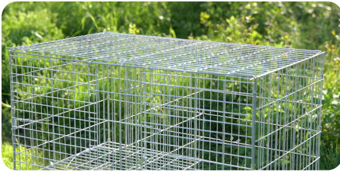
3) Fold over the top fence and secure with zip ties.